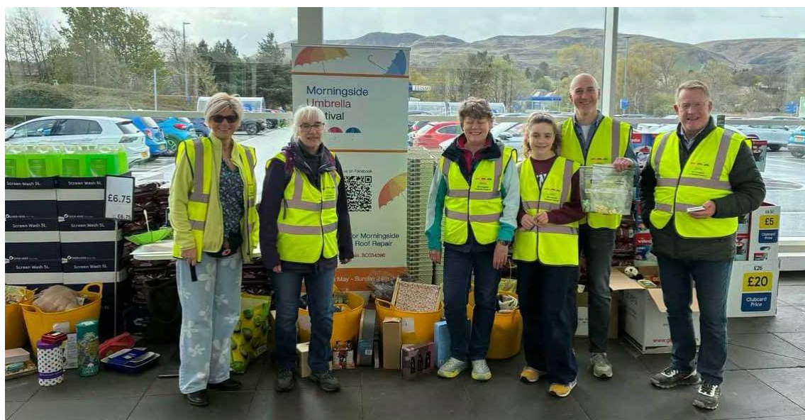
Some of the helpers for the Tombola at Tesco

Edinburgh:Morningside Parish Church of Scotland: Scottish Charity No: SCO34396