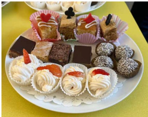
A selection of cakes at the bridge afternoon